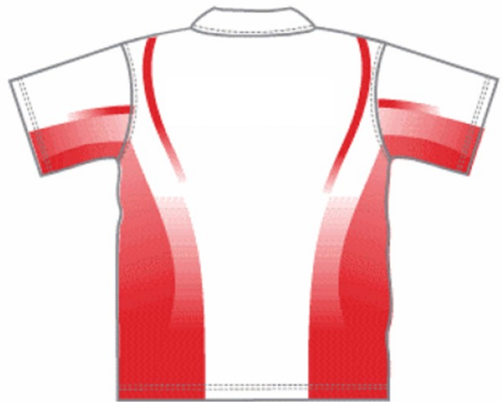
Pattern 052 - Polo S S - Unisex