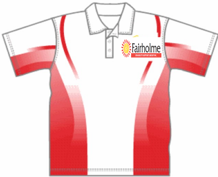
Pattern 052 - Polo S S - Unisex